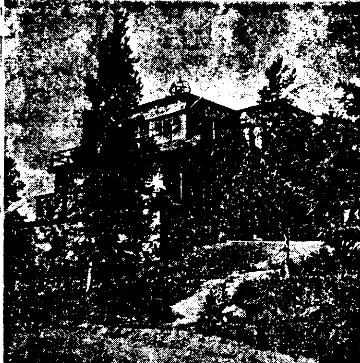
OBSERVATORY AT RANGELEY —The energy observatory at Orconon Institute operated at Rangeley by the Wilhelm Reich Foundation is shown above.