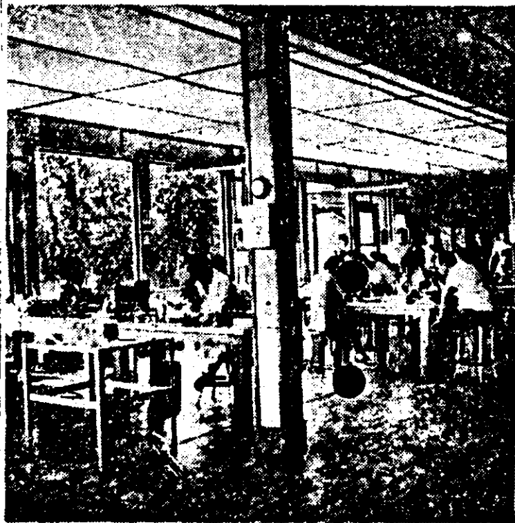
STUDYING AT RANGELEY —Orgonomic cancer research is being studied above in the students' laboratory at Orconon Institute at Rangeley.